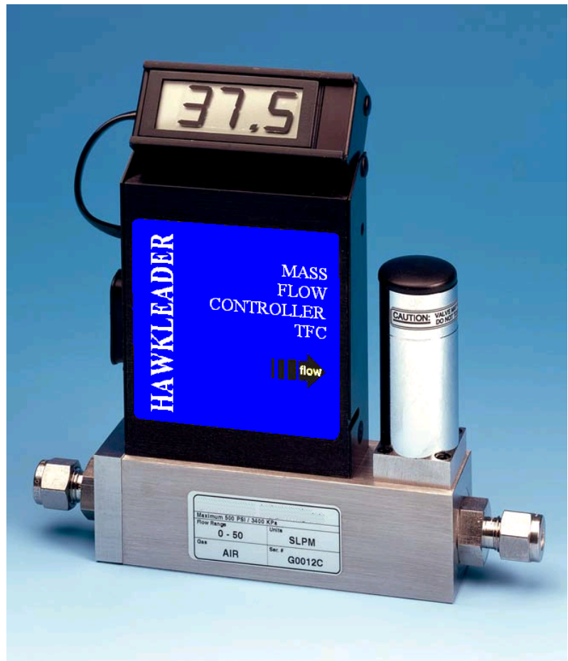
Typical Stainless Steel TFC Mass Flow Controller

The rugged design coupled with instrumentation grade accuracy provides versatile and economical means of flow control. Aluminum or stainless steel models with readout options of either engineering units (standard) or 0 to 100 percent displays are available.